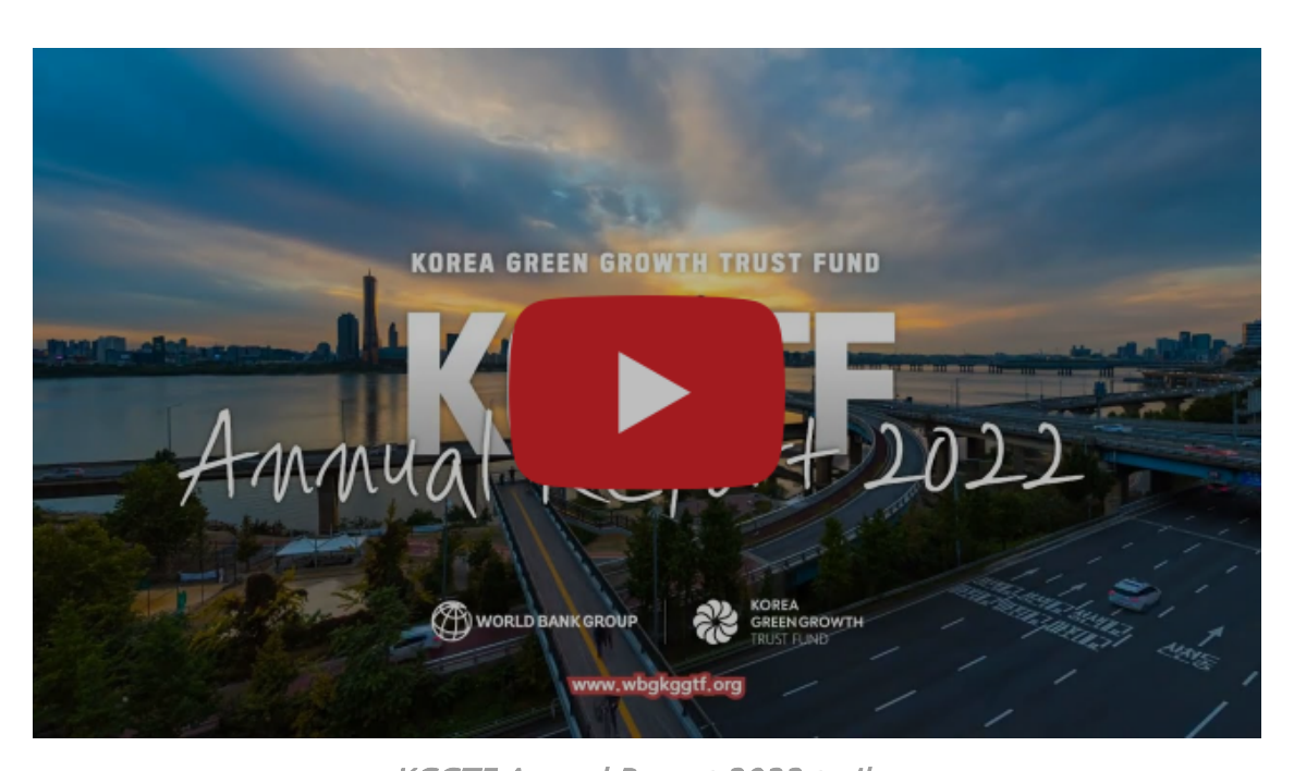
KGGTF Annual Report 2022 trailer

<u>Download the Report</u> | <u>Watch</u> the video